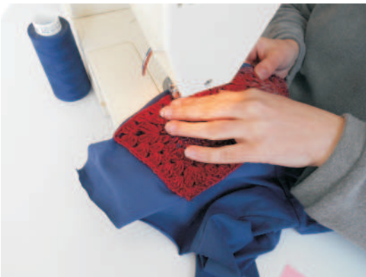
3 - Sew grannies/coudre les grannies

4 - Return the tshirt / mettre le tshirt sur l'envers