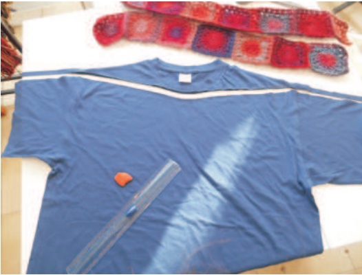
1 - Cut/couper